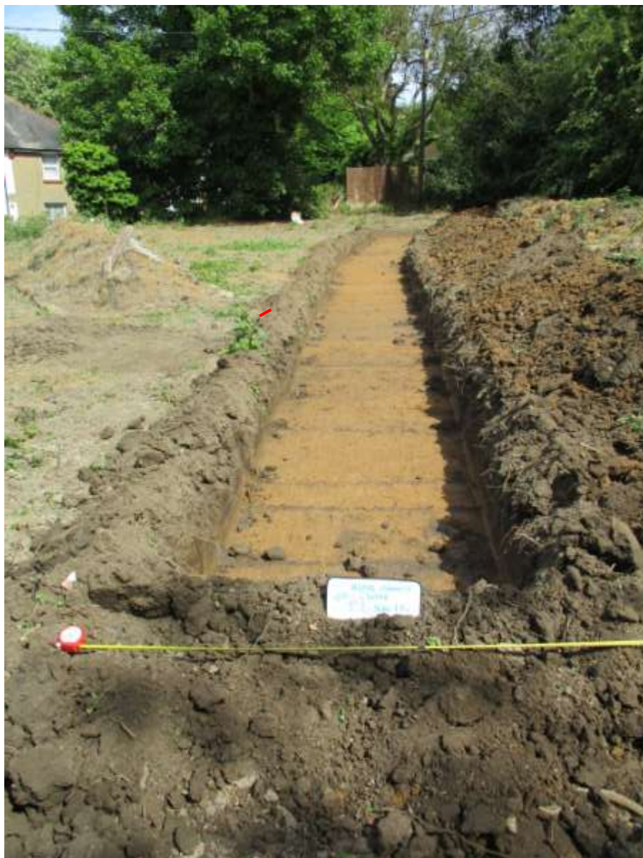
Plate 1. Trench 1 (looking W)