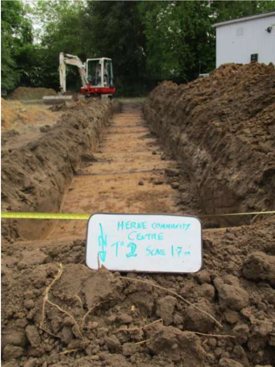
Plate 2. Trench 2 (looking S)