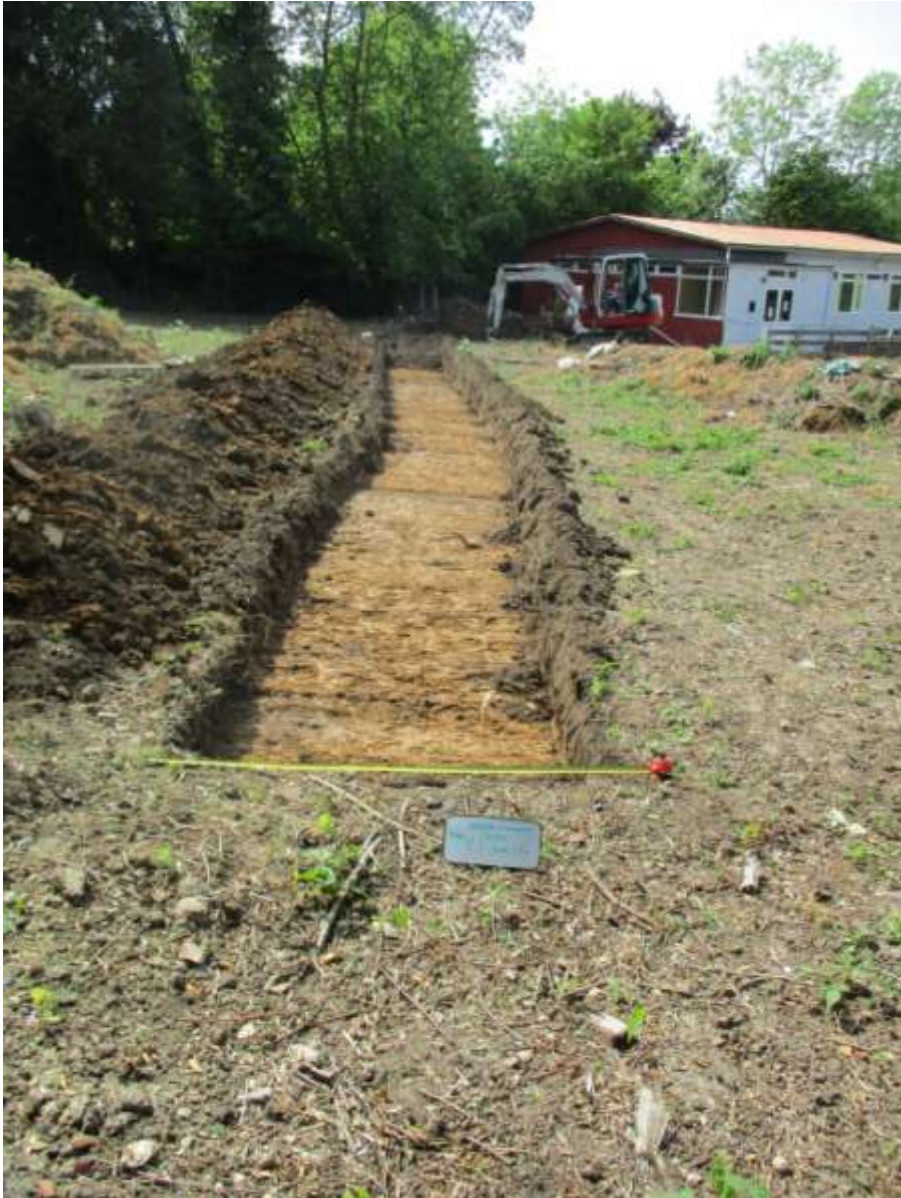
Plate 3. Trench 2 (looking N)